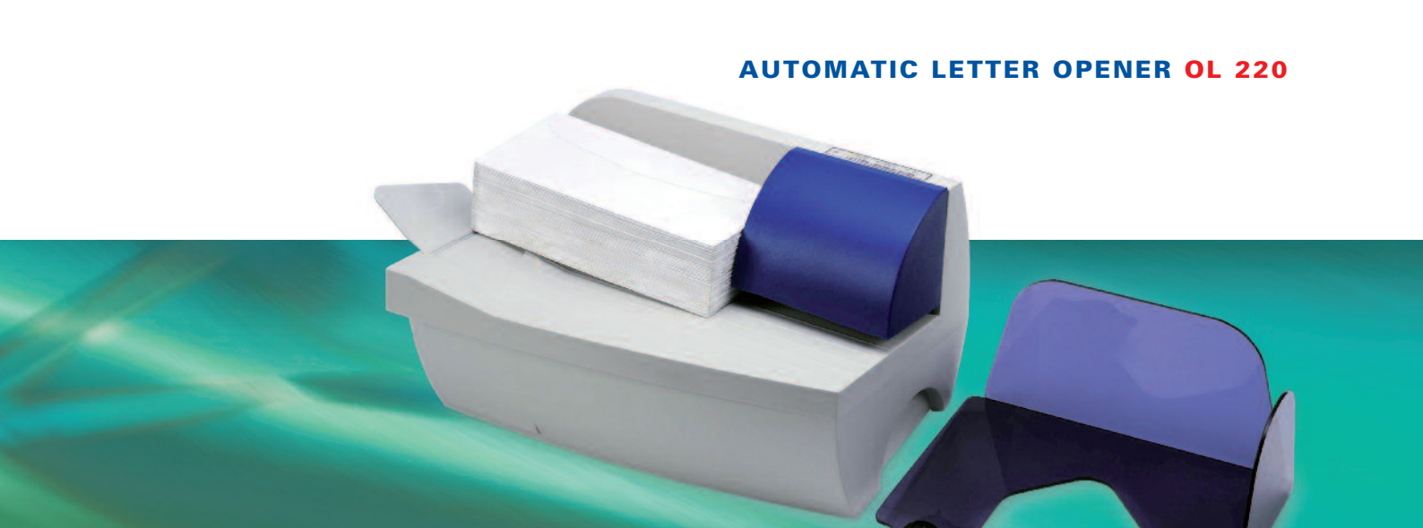
The "small one" with self adjusting envelope feeding up to B4 size